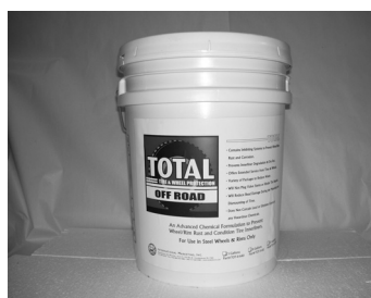
Formulated for Off-Road Tires!

Total Off-Road offers you the reliability and solid performance of a product that will effectively prevent corrosion, scale and pitting, provide cooler running tires, and prevent air loss through the inner liner and bead area. (5 Gallon Container)